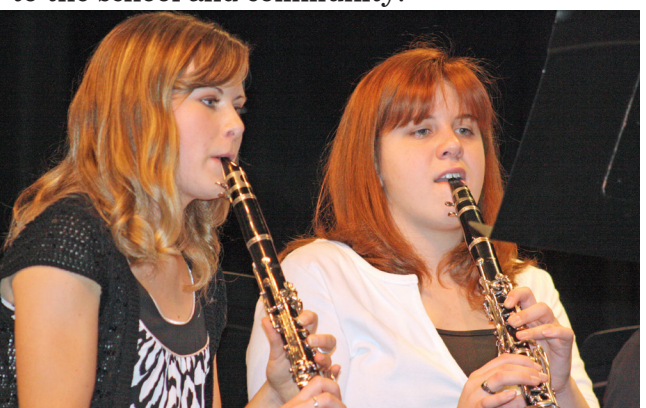
Two of a Kind (Above):

Through the marching band at football games, pep band at volleyball and basketball games, and concert and jazz band at concerts and competitions, the Viking Band continues to bring an earful of genuine instrumental music to the school and community.